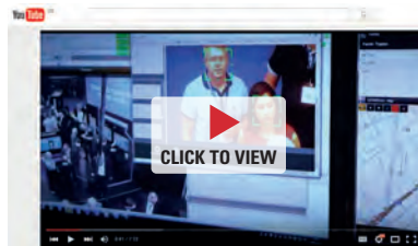
Pre-Crime will Blow Your Mind | CNBC International