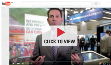
Driving the Future Through our Eco-System of Ventures

Many departments are looking at proactive policing, as advances in technology and data collection enable them to focus on hot spots and predict where a crime will likely happen. At the same time, their front lines are pressing for better, fresher information as investigations move from paper-based processes to automated, real-time data.